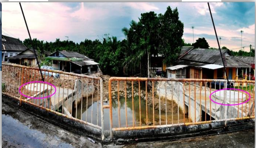
Sg. Skudai, CDS Model TWIN P3030