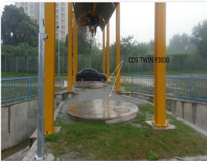
Sg. Batu (Pakej 1) CDS Model Twin P3030