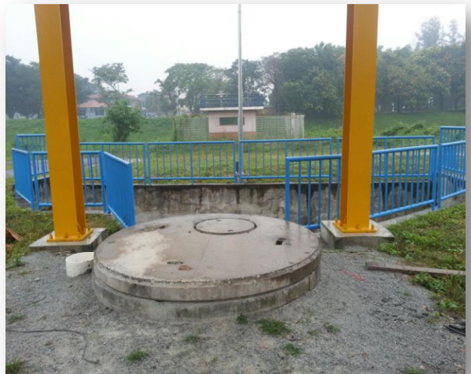
Sg. Batu (Pakej 1), CDS Model P2028