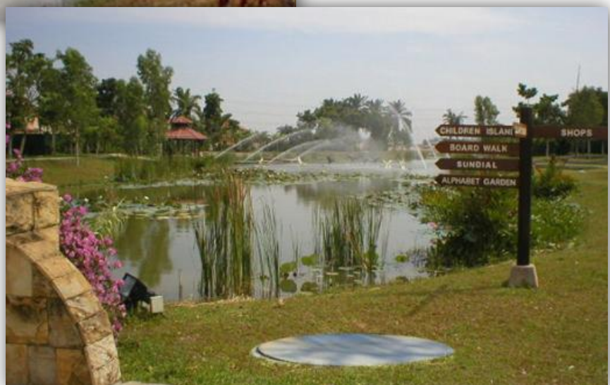
Bandar Botanic, CDS Model P0908