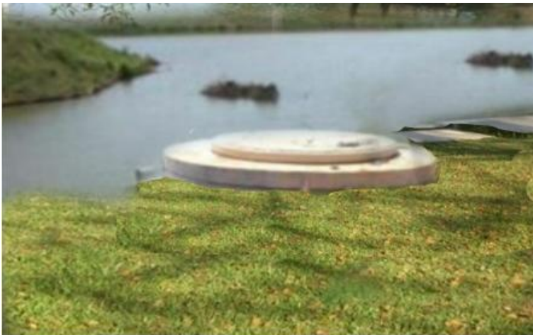
Pahang Technology Park CDS Model P2018