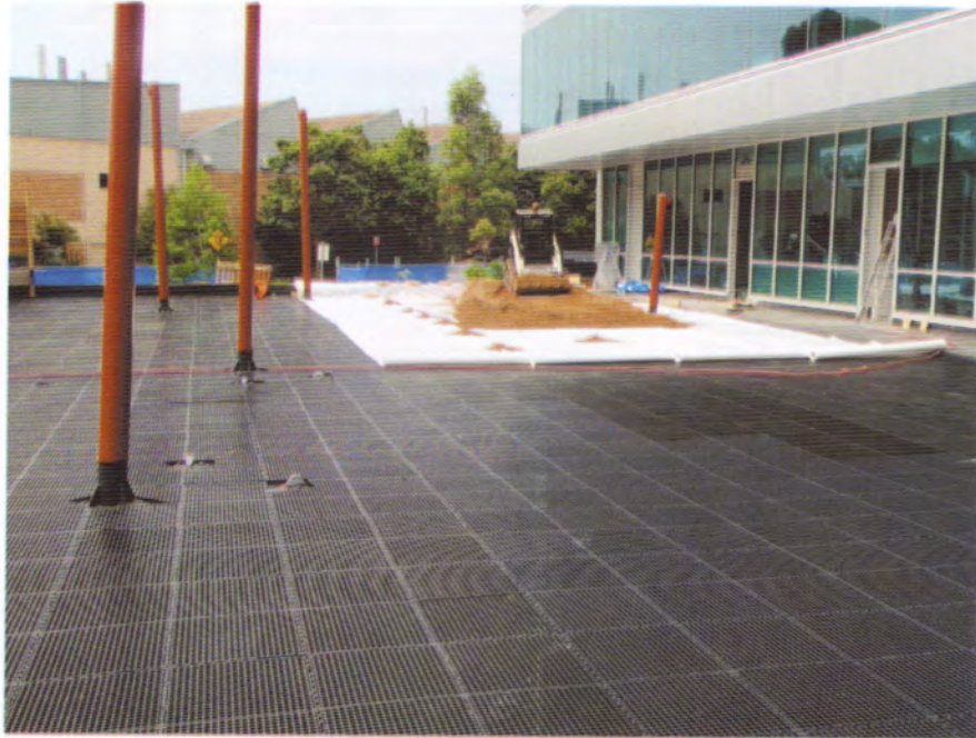
Drainage cell installation in progress.