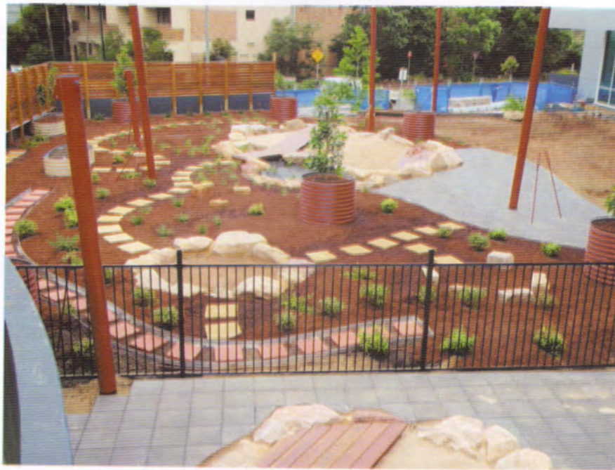
Construction of roof garden upon completion of drainage cell installation.